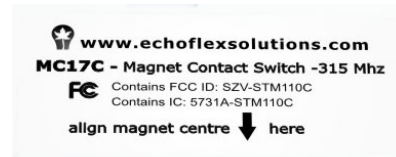
Back face label

The switch has a label on the back face indicating orientation of the magnet center marked with an arrow.