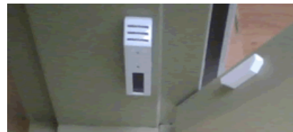
Installation example on a deep trim door

On some commercial applications with deep trim, the switch may have to be located with the solar cell facing downwards. This method is not ideal, but is acceptable with some ambient light to charge the solar cells.